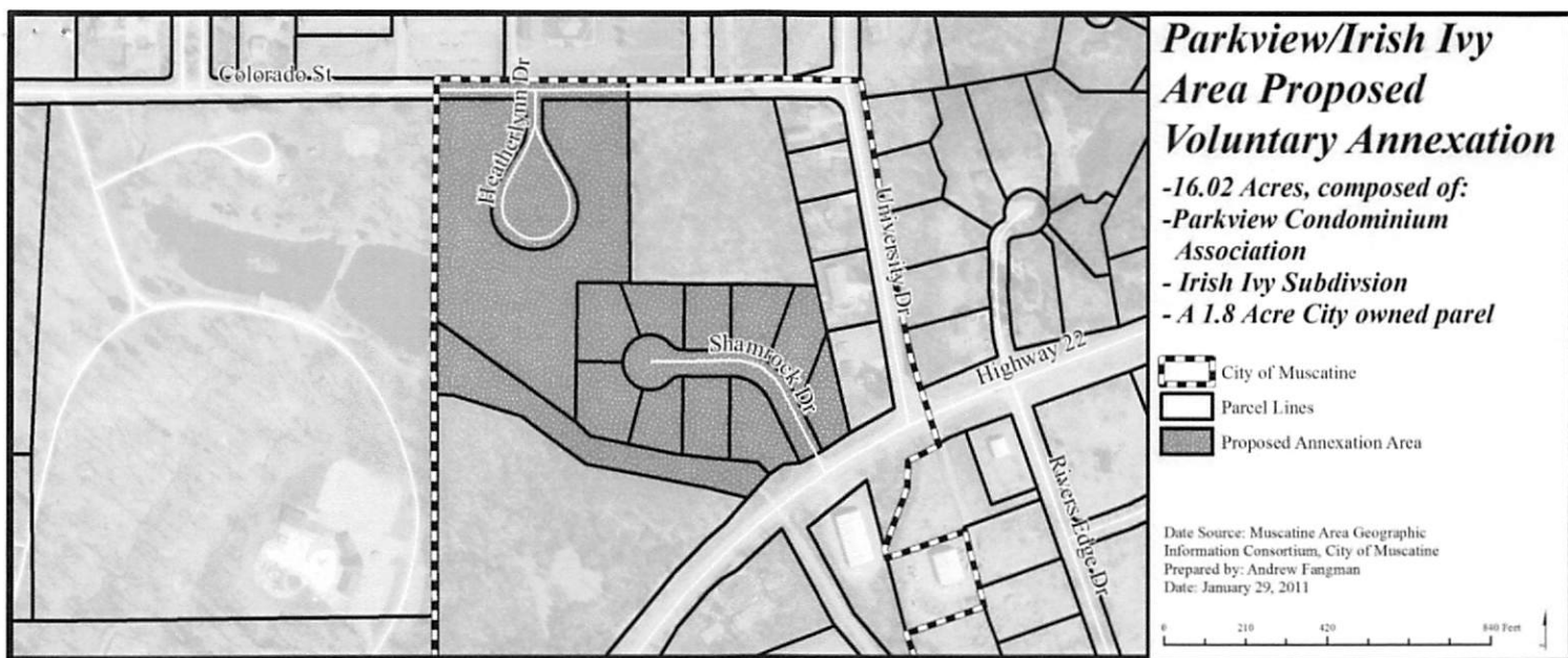
Figure 1: Map of Territory Proposed for Annexation

RECOMMENDATION/RATIONALE: It is therefore recommended that the City Council approve the attached resolution setting a public hearing to consider the voluntary annexation 2.81 acres of real estate comprised of the Irish Ivy Subdivision, Parkview Condominiums, and City owned parcel, for Thursday, April 5, 21012